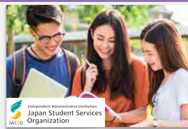
Japan Student Services Organization (JASSO)